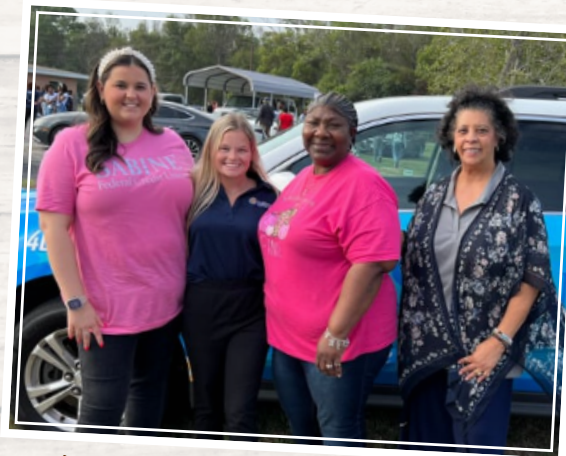
Sabine FCU at the West Orange Stark High School Homecoming Parade!