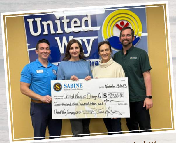
Sabine FCU presented the United Way of Orange County a check for $7,300.00 of funds raised during our campaign this year!