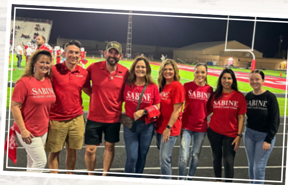
Sabine FCU joins the fun at Bridge City High School Football Night!